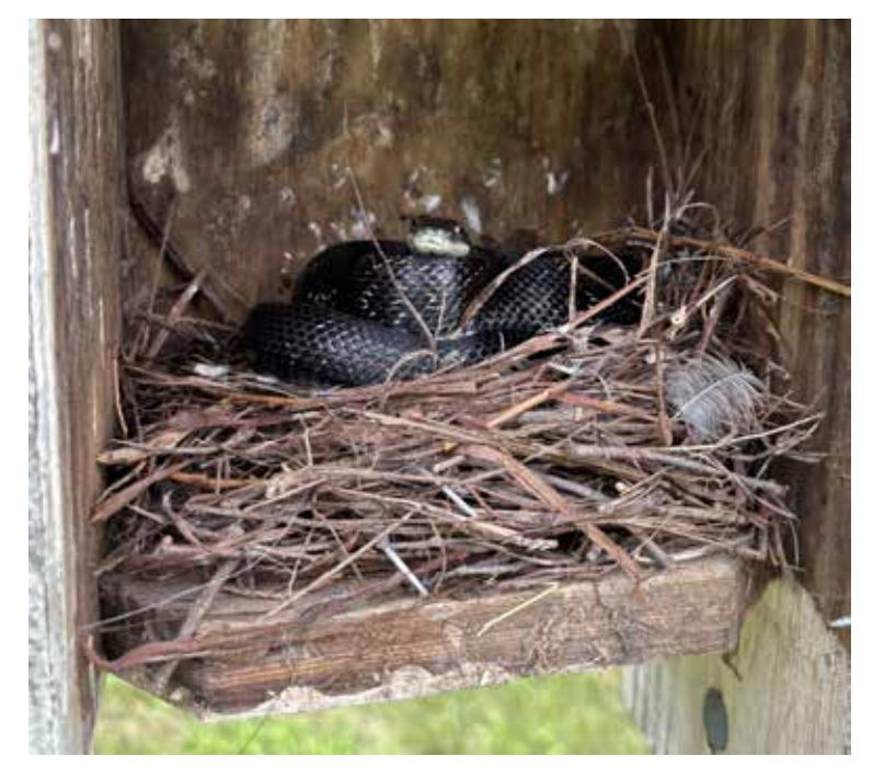
Eastern Rat Snake after it snacked on young House Wrens.