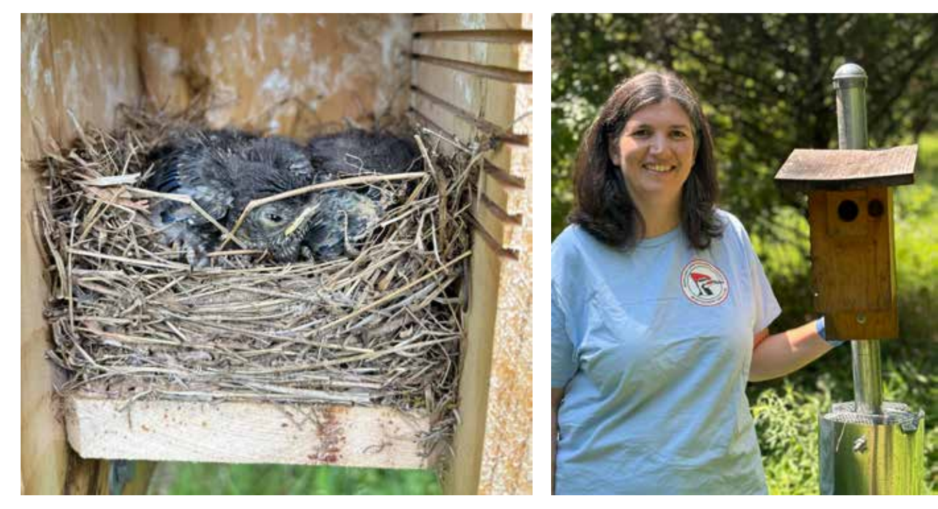
Young Eastern Bluebirds in a nest—one looking disgruntled at being disturbed.