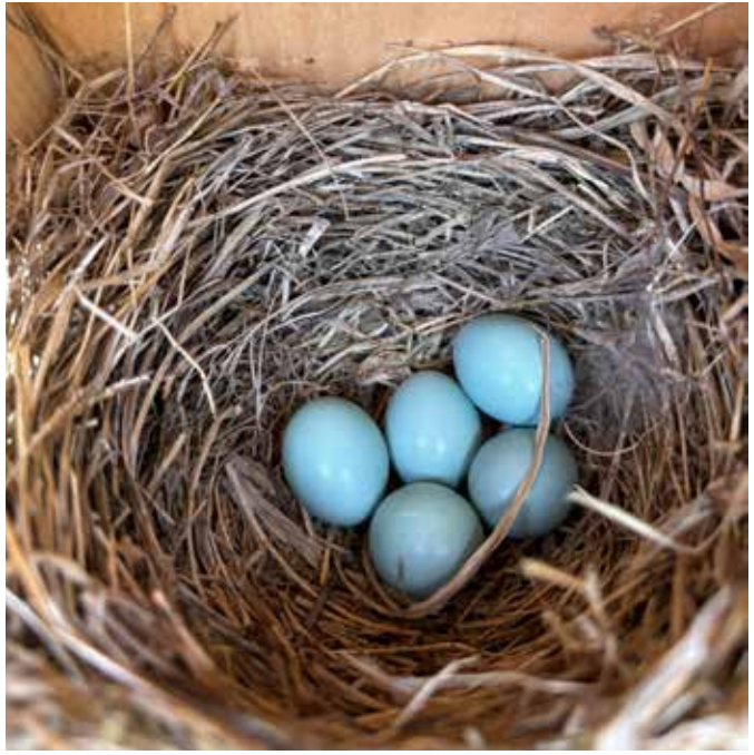
Eastern Bluebird eggs in a nest.