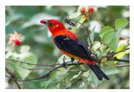
Scarlet Tanager at Patuxent Research Refuge North Tract.