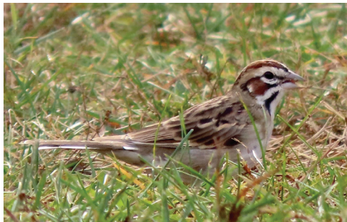
Lark Sparrow at Woodstock Equestrian Park.

Dry weather conditions from late summer to early fall in combination with southbound migration made for some good inland shorebirding over the past few months. Exposed shoreline and sandbars at Triadelphia Reservoir attracted 2 Baird's Sandpipers reported by Joe Hanfman on August 30. Dave Roberts found a Sanderling in the same location on August 27. On September 24, Dave Ziolkowski found an impressive shorebird mix at Triadelphia Reservoir that included 12 Black-bellied Plovers , 2 American Golden-Plovers , Stilt and Baird's Sandpipers , and 14 White-rumped Sandpipers . Dave Roberts had a Black-bellied Plover at the Hughes Rd Polo Fields on September 24. Dave Czaplak reported a flyby Whimbrel over the Potomac River adjacent to Violette's Lock on August 22. Jared Fisher found a Buff-breasted Sandpiper at the Hughes Rd Polo Fields on August 26. Mary Ann Todd and Dave Czaplak found an Upland Sandpiper at the Polo Fields on August 20. Early November saw a good passage of Dunlin through our area, with birds being reported from both Blue Mash Nature Trail and the Potomac